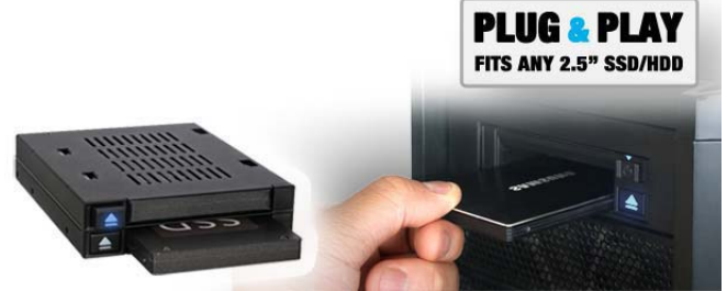
ICY DOCK FlexiDOCK MB522SP-B