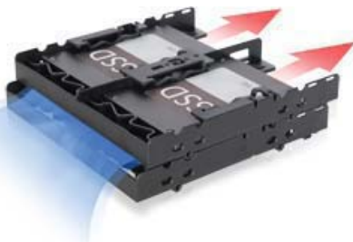
ICY DOCK Quattro MB344SP