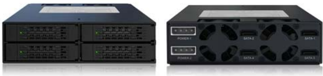
ICY DOCK ToughArmor MB994SP-4S