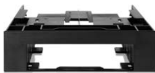
FLEX-FIT 5.25" to 3.5" Drive Bay Conversion Kit