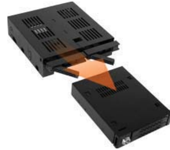
ICY DOCK ExpressCage MB322SP-B