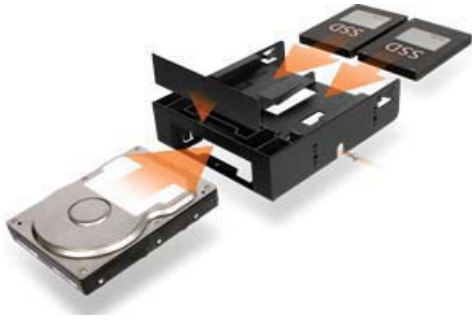
ICY DOCK FLEX-FIT MB343SP