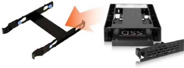
ICY DOCK EZConvert MB882SP-1S-3B