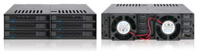
ICY DOCK ExpressCage MB326SP-B