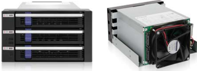
ICY DOCK FatCage MB153SP-B