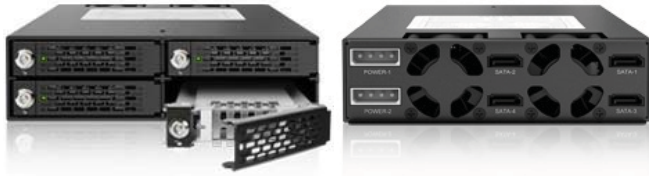
ICY DOCK ToughArmor MB994SK-1B