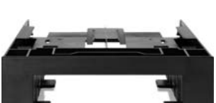
FLEX-FIT 5.25" to 3.5" Drive Bay Conversion Kit