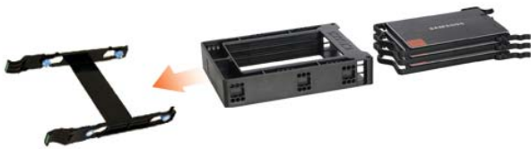
ICY DOCK EZ-Fit Trio MB610SP