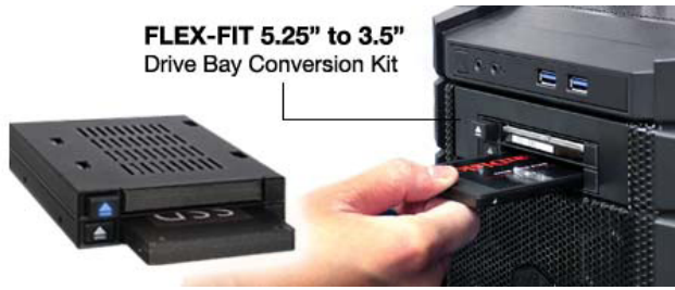
ICY DOCK FlexiDOCK MB521SP-B