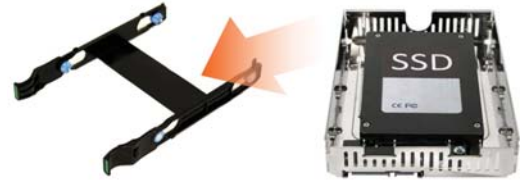
ICY DOCK EZConvert Air MB482SP-3B