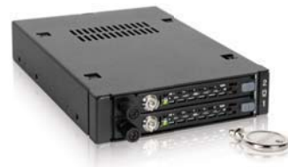
ICY DOCK ToughArmor EX MB492SKL-B