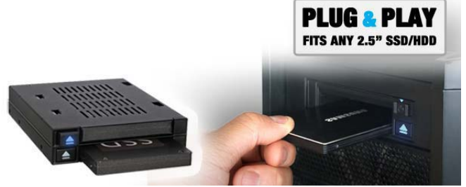
ICY DOCK FlexiDOCK MB522SP-B