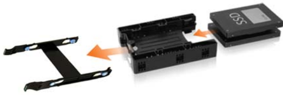
ICY DOCK EZ-Fit Lite MB290SP-B