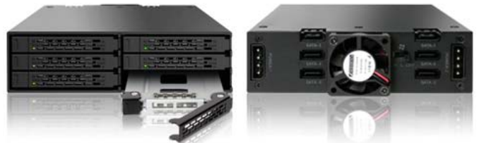
ICY DOCK ToughArmor MB996SP-6SB