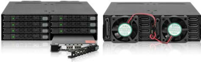
ICY DOCK ToughArmor MB998SP-B