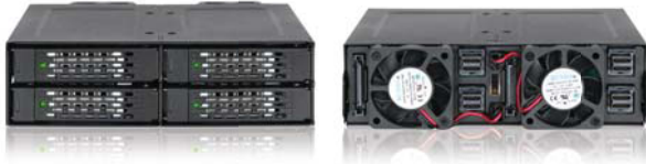
ICY DOCK ToughArmor MB699VP-B