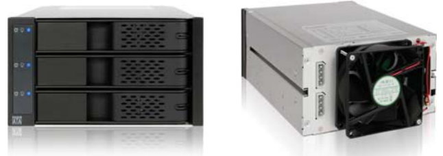
ICY DOCK FlexCage MB973SP-1B