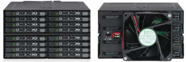
ICY DOCK ToughArmor MB516SP-B