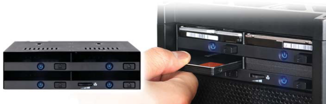
ICY DOCK flexiDOCK MB524SP-B