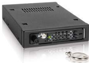
ICY DOCK ToughArmor EX MB491SKL-B