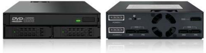
ICY DOCK ToughArmor MB994IPO-3SB