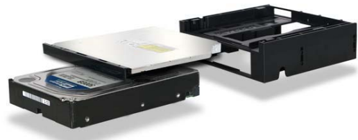
ICY DOCK Flex-Fit Trio MB343SPO