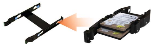
ICY DOCK EZ-Fit MB990SP-B