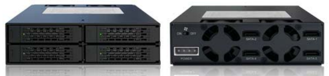
ICY DOCK ToughArmor MB994SP-4SB-1