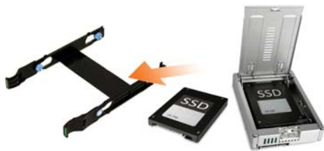
ICY DOCK EZConvert Pro MB982IP-1S-1 / MB982SP-1S