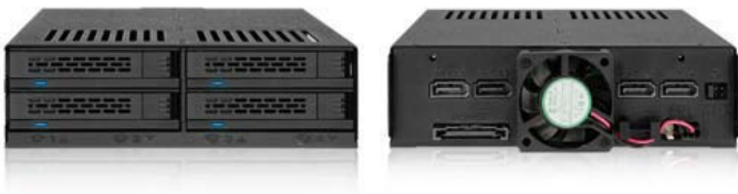
ICY DOCK ExpressCage MB324SP-B