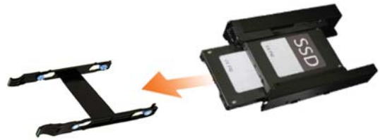
ICY DOCK EZ-Fit Pro MB082SP