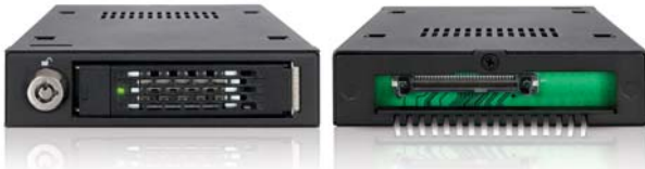
ICY DOCK ToughArmor MB601VK-B